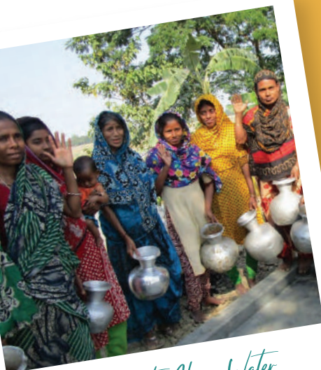
Access to Clean Water

45 homeless street children in Dhaka were provided food every day