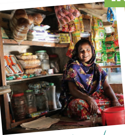
Rafia is Empowered

An additional 1,003 trees were planted in areas served